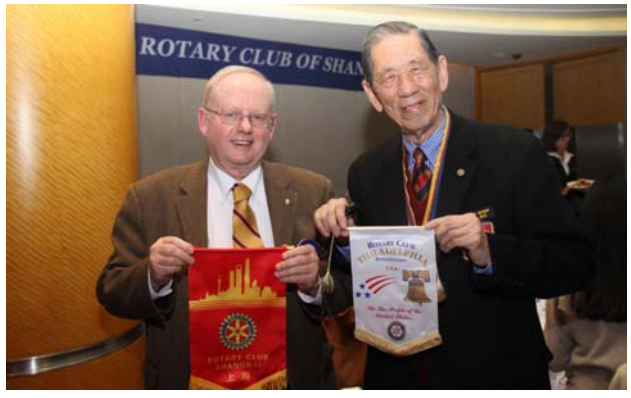
Exchanging Banners with the RC Philadelphia

He introduced Coca Cola's 2020 global goals, which cover six aspects: agriculture, water, package, the ozone layer, sustainable products and carbon emission. Coca Cola cooperates with governments and other multinationals to share their common value, hoping to encouraging society to adopt new ideas and values.